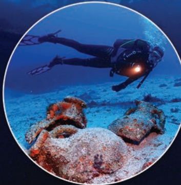
PADI OPEN WATER DIVER COURSE (duration 3-4 days)