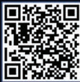
PADI ADVANCED OPEN WATER DIVER COURSE (duration 2-3 days)