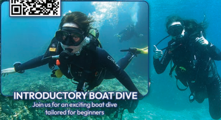
INTRODUCTORY BOAT DIVE Join us for an exciting boat dive tailored for beginners