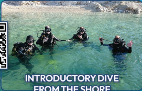
INTRODUCTORY DIVE FROM THE SHORE (IN FRONT OF THE DIVING CENTER) Experience a guided introductory dive