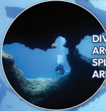
DIVING TRIPS AROUND SPLIT AREA