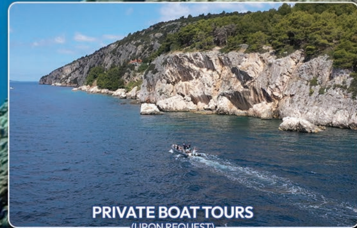
PRIVATE BOAT TOURS