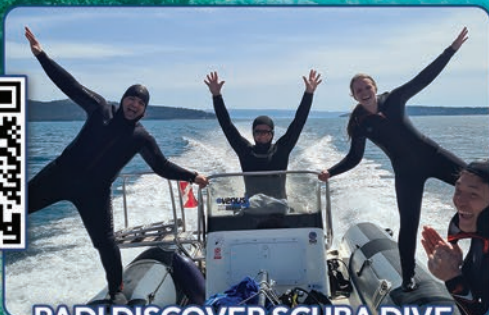
PADI DISCOVER SCUBA DIVE (2 INTRODUCTORY BOAT DIVES) Experience two introductory dives by boat with qualified instructors. This beginner program offers the opportunity to continue your education through the PADI Open Water Diver course